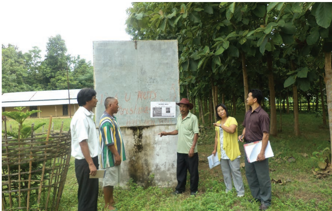
Water reservoir at constructed under WATSAN at Mhaikam village