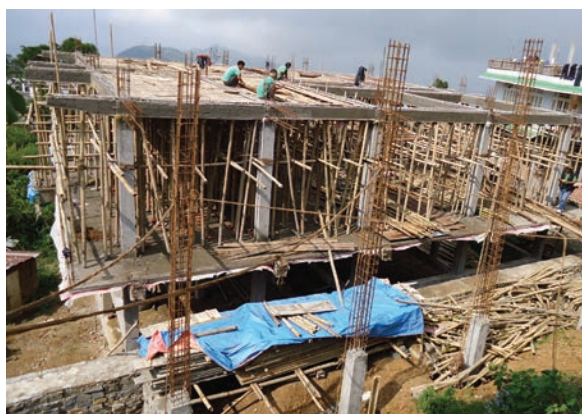
Construction of DE Office at Mokokchung