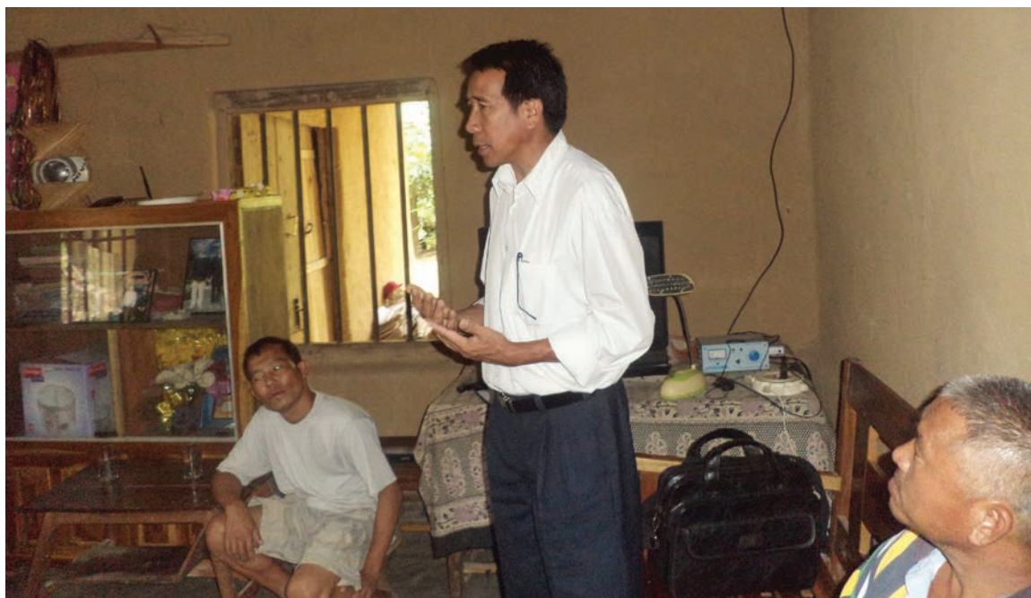
Explaining purpose of the study at Mhaikam village