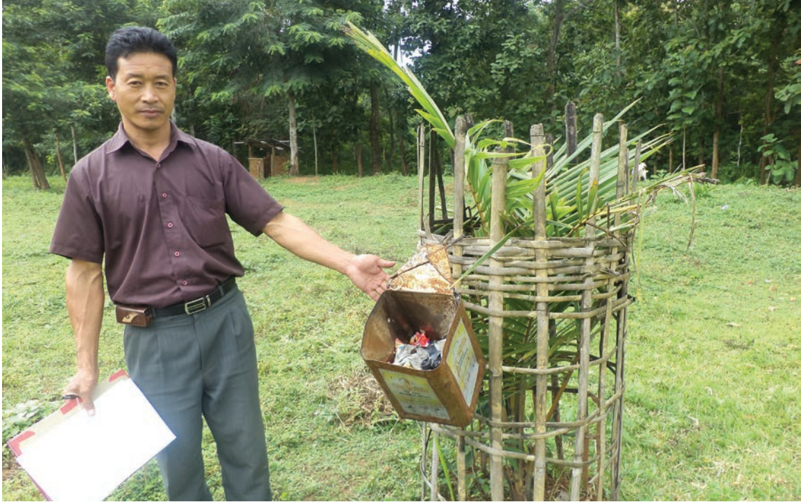
Sanitation waste bin supplied by PHE Department to Mhaikam village