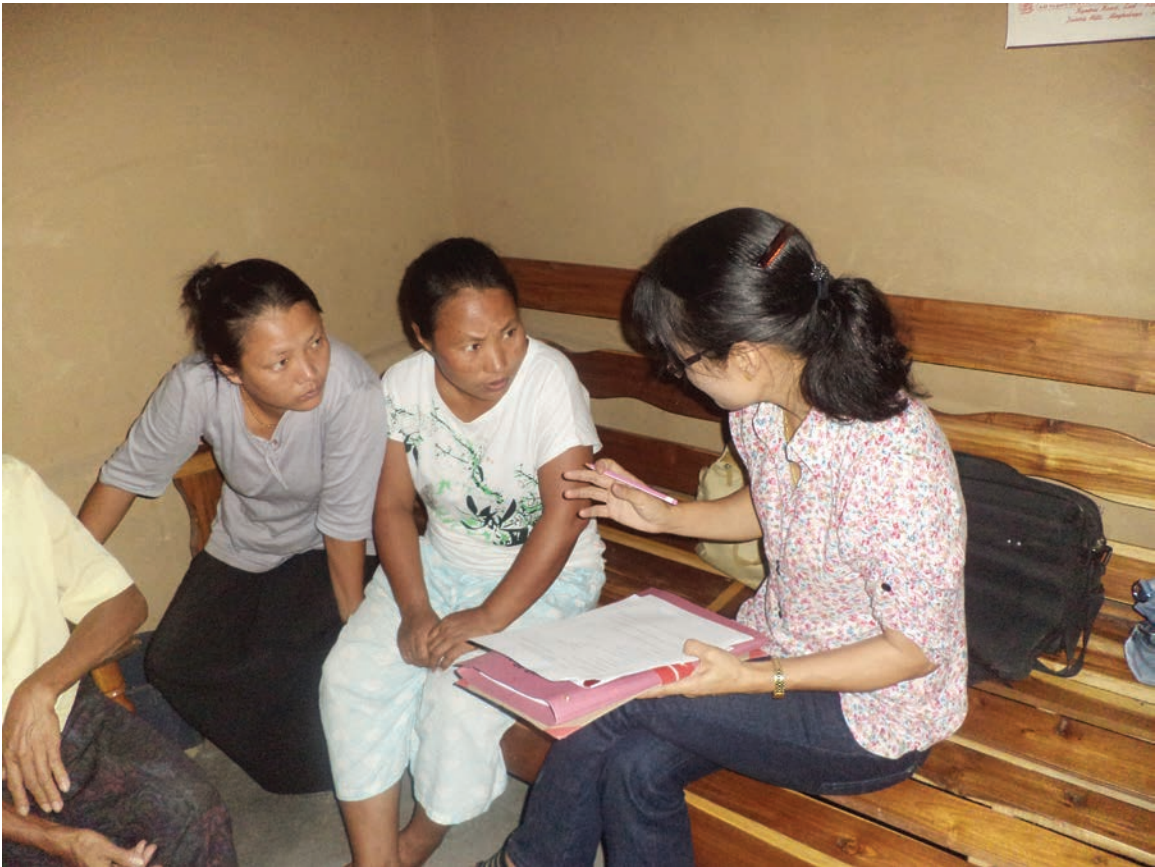
Beneficiary being interviewed by an evaluator at Mhaikam village