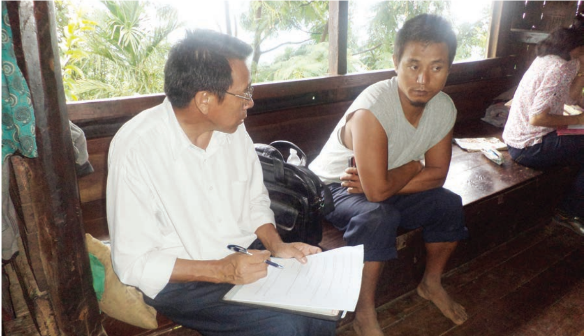
Evaluator interviewing the beneficiaries on WATSAN at New Peren