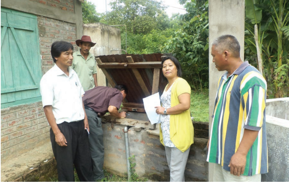
Inspection of ring well by verification team along with WATSAN Chairman, GB at Mhaikam village