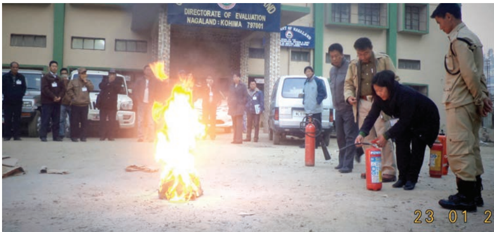
Officials from Department Fire and Emergency Services demonstrating how to handle fire extinguishers to staff/officers of Evaluation Directorate.