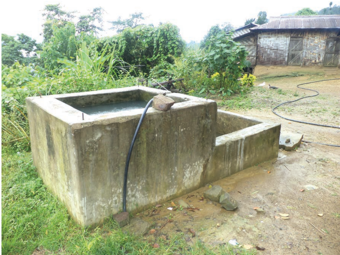
Water tank constructed under WATSAN at New Peren