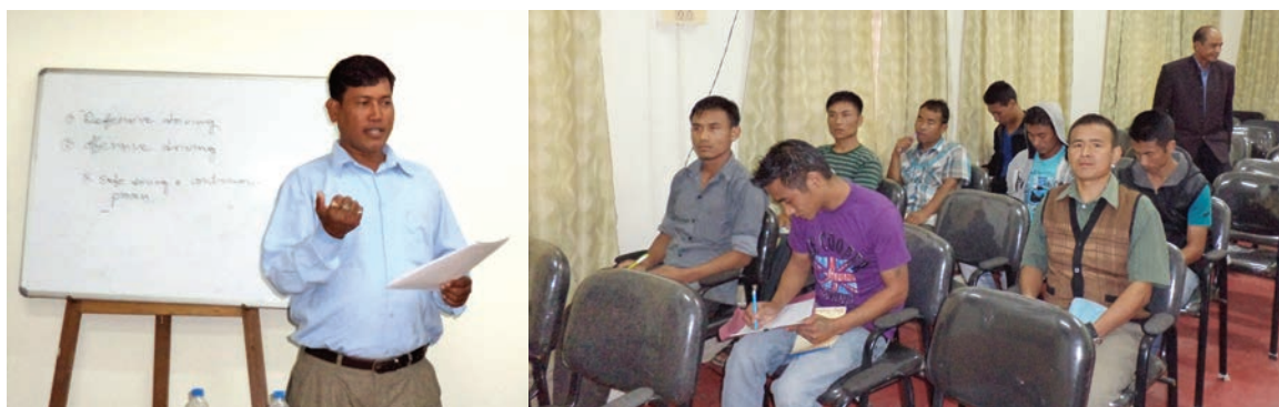
Resource person in a session with drivers under the Evaluation establishment