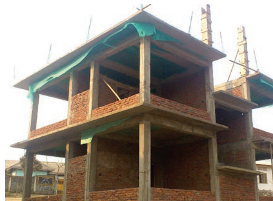
Construction of DE Office at Mon