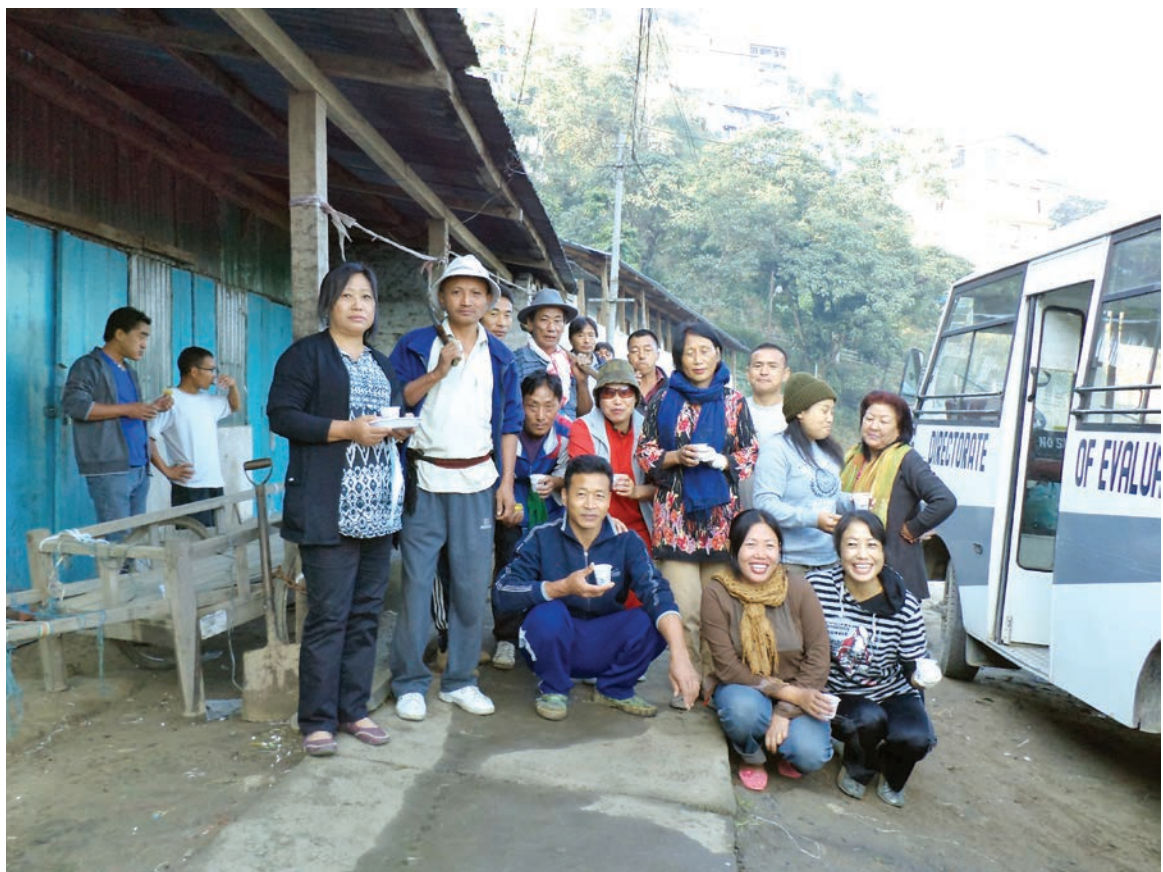
Officers and Staff of the Evaluation Directorate participating in Mass social work organized by the State Government