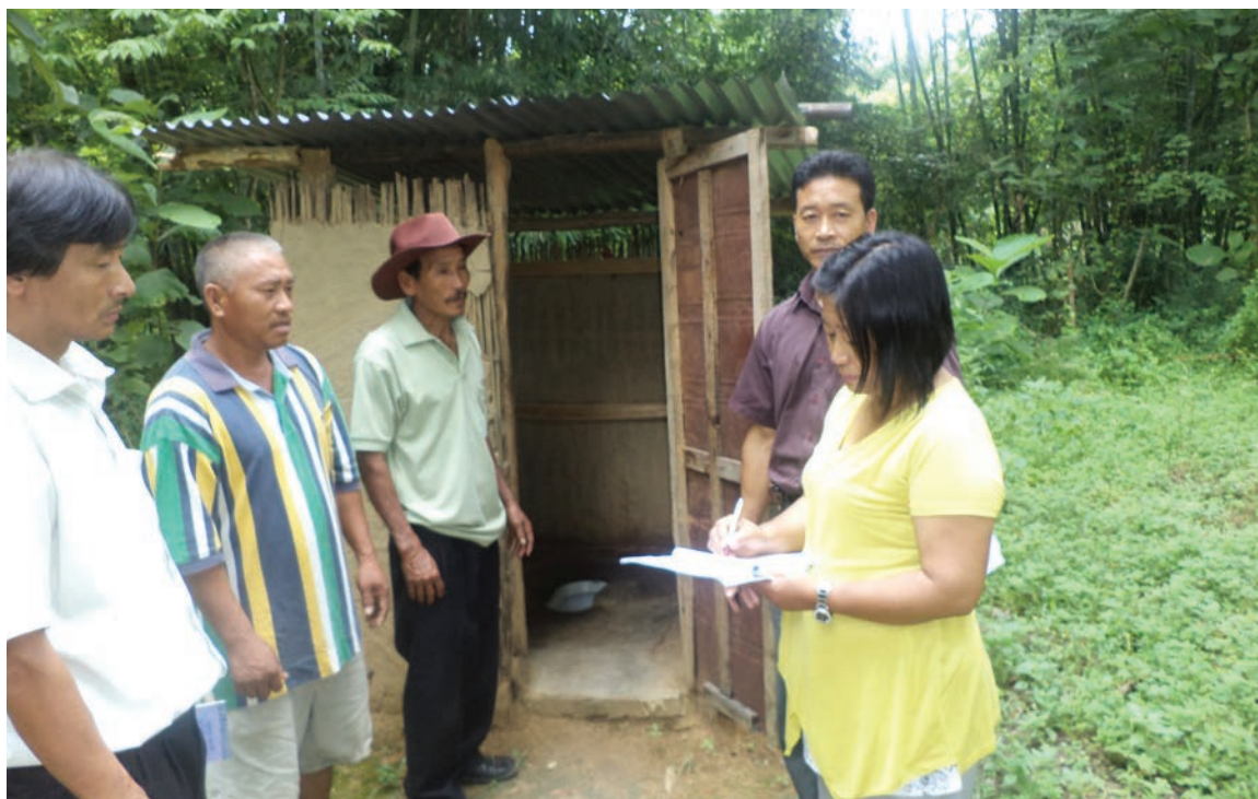
Verification team along with beneficiaries at Mhaikam village