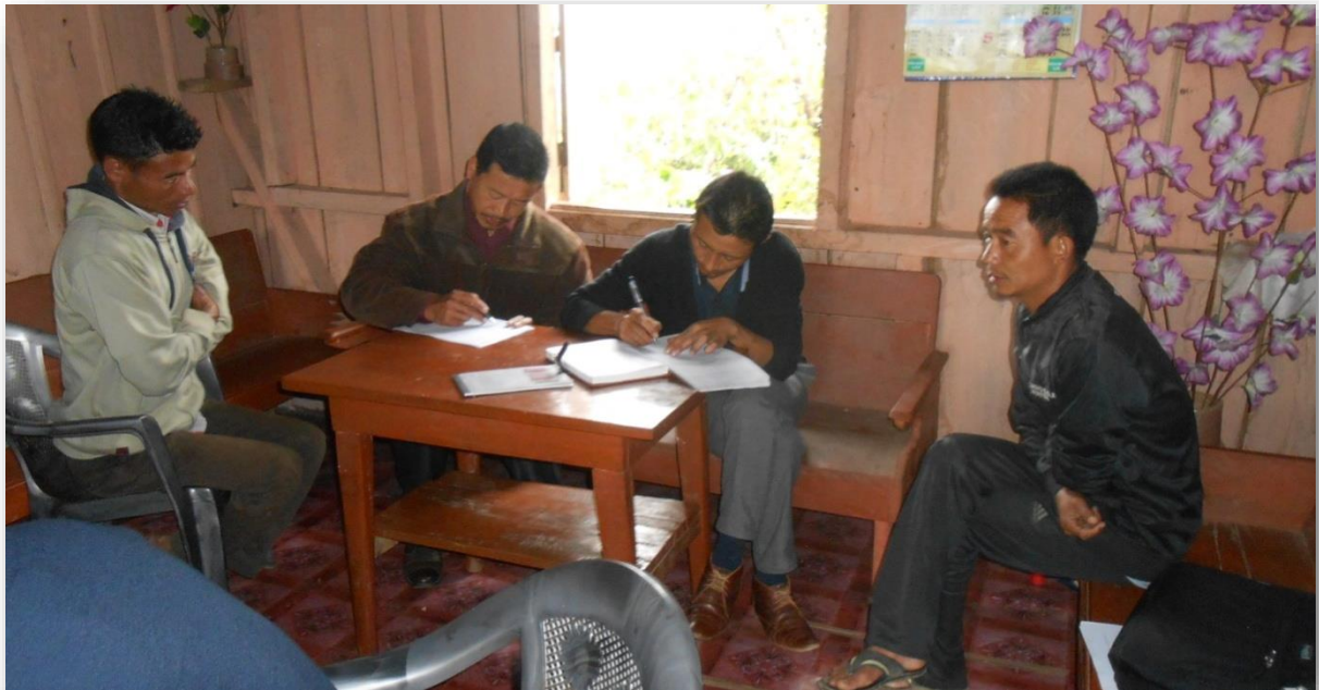
Photo Gallery Technical officials during field visit.