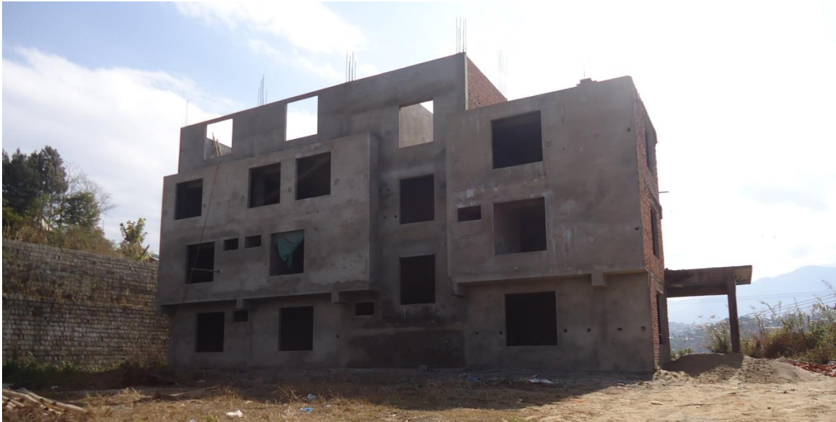
Constructions of New Directorate office Building near the Nagaland Civil Secretariat, Kohima.