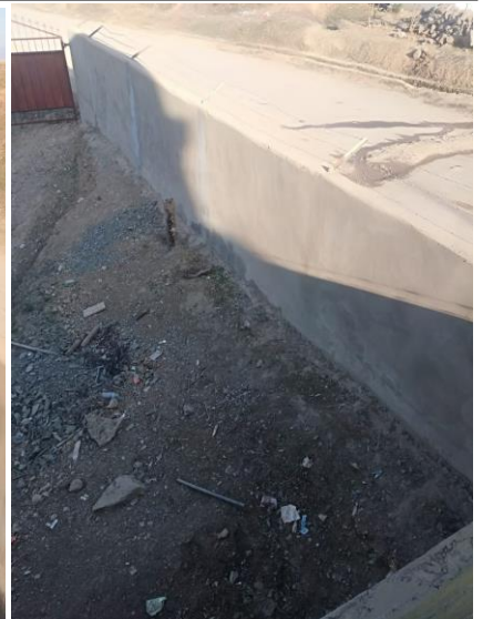
Construction of security fencing with steel gate and retaining wall at DEO Kiphire