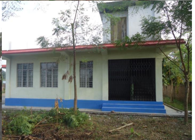
Constructions of Steel gate, Fencing and repair renovation of District Evaluation office, Dimapur.