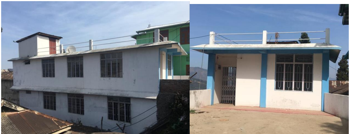
Constructions of District Evaluation office Building in Tuensang District