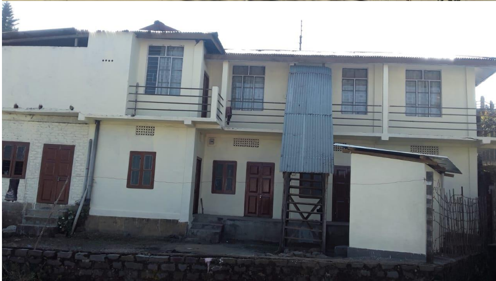
Repair and Renovation of District Evaluation Office, Wokha.