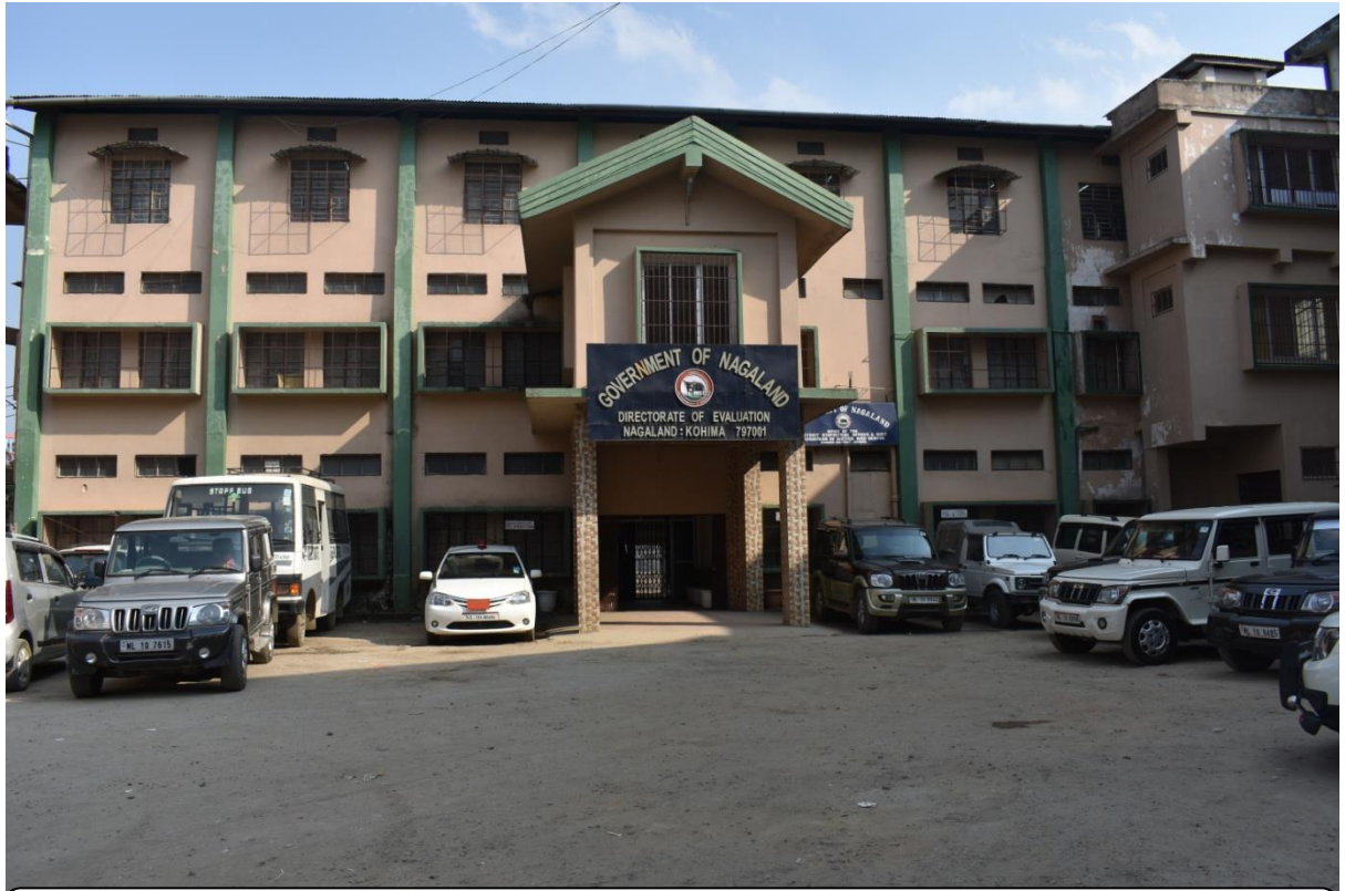
Evaluation Directorate office building, A.G Road ,Kohima