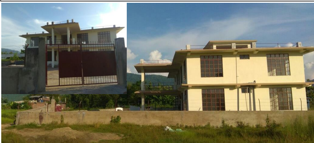
Constructions of Steel gate, Security Fencing of District Evaluation Staff Quarter, Dimapur.